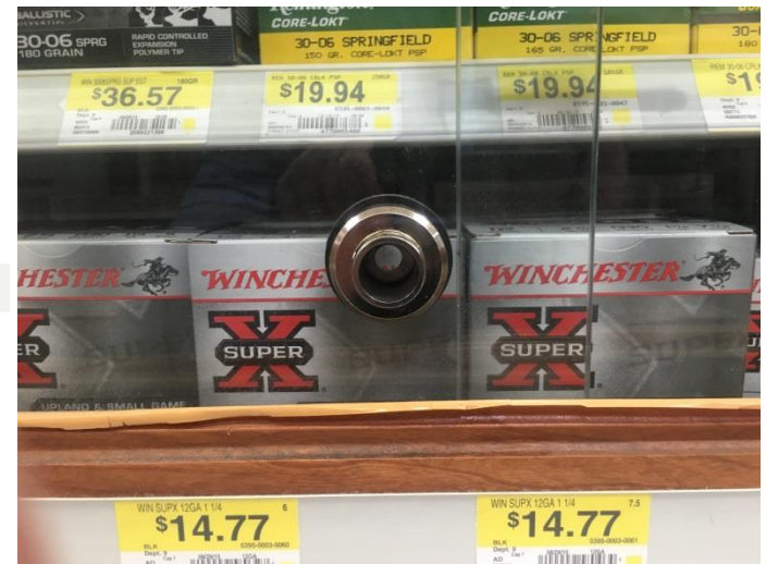
RLK260B5PNNY (CB Lock)