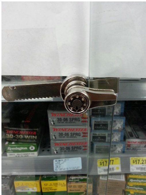
PLK250S3PNYY (FM LOCK)